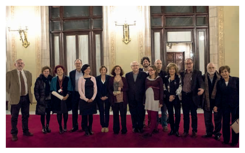
2016 ICIP Award granted to Peace Brigades International

Previously, on February 7<sup>th</sup>, the awarding ceremony of the 2016 ICIP Peace in Progress Award, given to Peace Brigades International for their work in supporting and protecting threatened human rights defenders, had taken place in the Parliament of Catalonia.