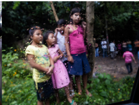
2. A group of children watch the arrival of the forensic doctor's van in the outskirts of Soyapango. In the more violent zones of El Salvador, children know that the arrival of this vehicle means that someone has been murdered.