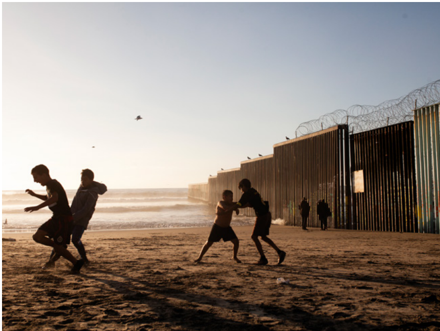
These children are play fighting next to the wall separating Mexico from the United States in the Playas de Tijuana zone.