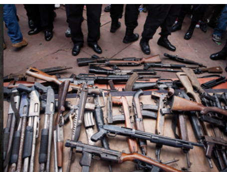
6. The Mara Salvatrucha and Barrio 18 gangs lay down their arms in the central square of San Salvador as a symbolic action in the process of ending the violence that began in 2012.