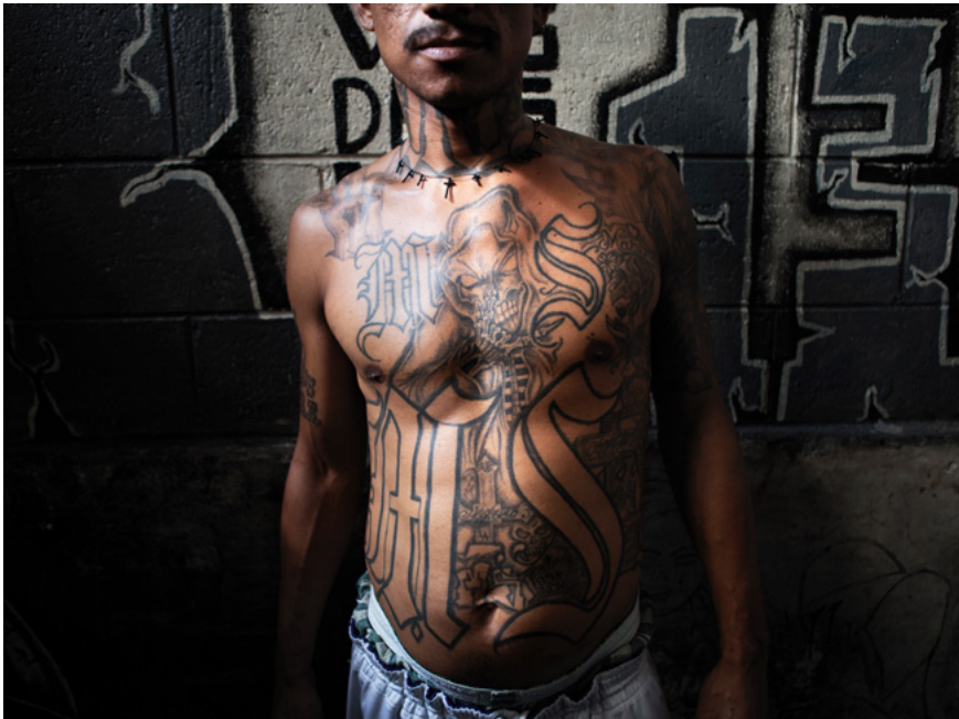
A member of Mara Salvatrucha in the prison of Ciudad Barrios. In El Salvador, there are separate prisons for the different gangs because of internecine bloodshed and violence against the civilian population.