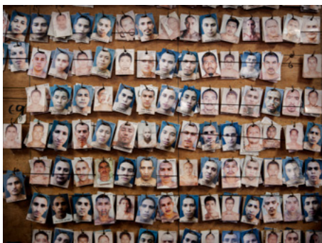
1 Panel rudimentario para controlar la ubicación de los presos en el interior de Izalco, cárcel exclusiva para miembros del Barrio 18 en El Salvador.