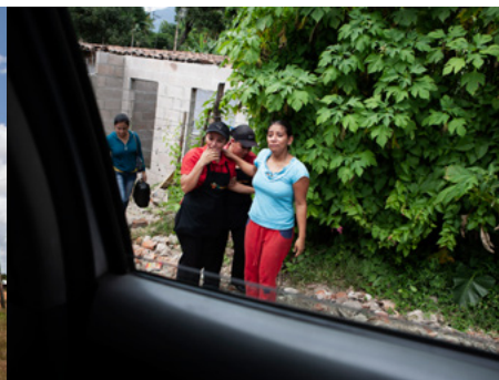
5 A woman cries when the forensic medical expert's vehicle leaves with the corpse of her husband who was murdered in Soyapango, El Salvador.