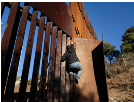
4. A man climbs the border wall in the Tijuana zone in an attempt to cross. During the caravan of 2018, despair drove many migrants who crossed to surrender immediately to the U.S. border patrols.