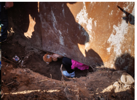
3. A little girl crosses the border at wall between Mexico and the United States through a hole her parents have dug.