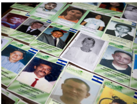
1. Posters showing migrants from El Salvador who disappeared on their way to the United States. More than 3,000 people have died or disappeared on this migrant route since 2014.