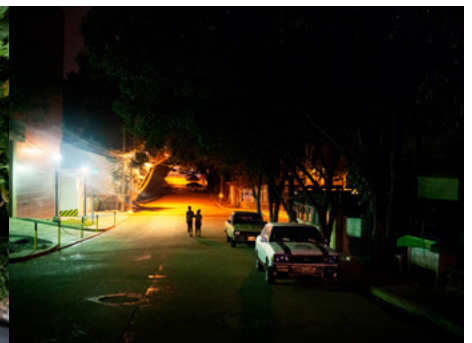
6 Two young transsexuals walk along a Tegucigalpa street at night. Violence against transsexuals and homosexuals has reached extreme levels in Honduras.