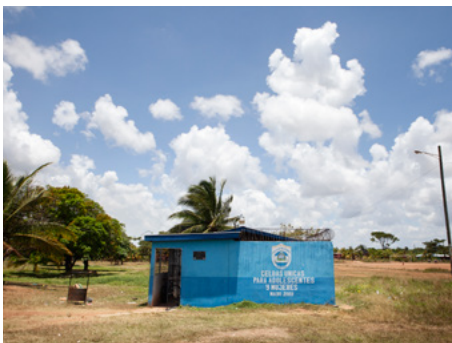
4 Police cells for the exclusive use of women and adolescents in the Mosquito Coast region of Nicaragua.