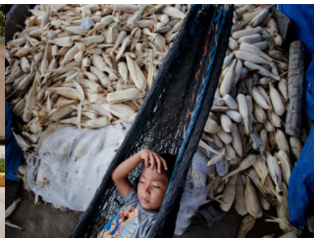
2. A six-year-old boy witnessed a group of policemen kidnapping his sixteen-year-old brother. The two boys live in the Bajo Aguán zone of Honduras where there is ongoing conflict among farmers, the authorities, and powerful landowners over control of the African palm plantations.