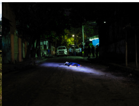
2. On 20 May 2019 sixteen shots were heard in the town of Colonia San Antonio, El Salvador. Later, the body of a young man was found. He had been subjected to extortion by one of the gangs in the area.