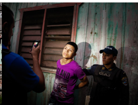
5. A young member of Los Tercereños gang has been caught red-handed in the Rivera Hernández neighbourhood, which is considered to be the most dangerous in San Pedro Sula, Honduras.