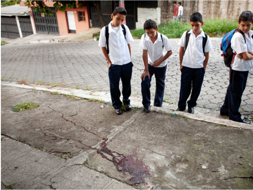
A group of students look at the blood left by the body of another student who was murdered in the town of Soyapango, El Salvador.