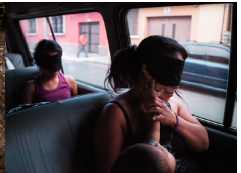
3 A woman and her children have been blindfolded before being taken to a shelter for victims of family violence in Guatemala City. This procedure is followed in case the victim changes her mind and tells the aggressor where they are staying.