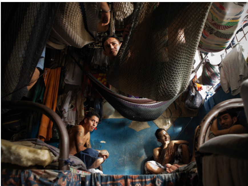
The prison for members of the Barrio 18 gang in Cojutepeque, El Salvador. Central America has one of the world's most overcrowded prison populations.