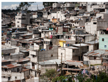
4. The marginal zone of "El Esfuerzo" Community in the centre of Guatemala City, a few minutes from the country's highest skyscrapers, is controlled by the Barrio 18 gang.