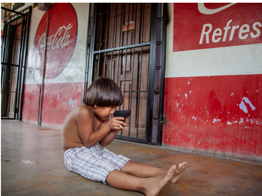
A boy plays with a toy pistol at a grocer's shop in Bajo Aguán, Honduras.