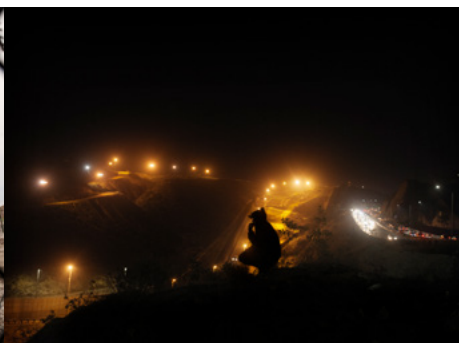
6. A twenty-five-year-old Honduran waits for the best moment to get past the wall erected by the United States. Trying at night is more dangerous but there are fewer chances of being detained.