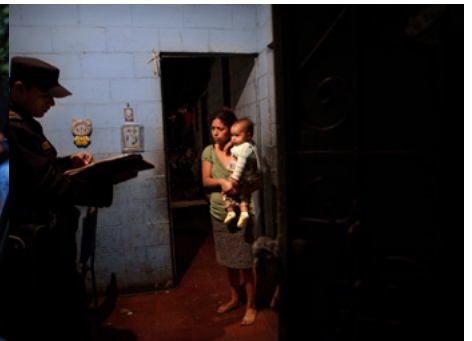
3. A policeman informs a woman that her husband has been arrested in a police operation against the gangs and that he is to be charged with murder.