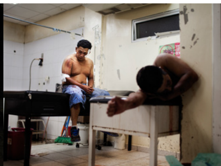
3. Two men with machete wounds in the Traumatology emergency room of the Mario Catarino Rivas Hospital in San Pedro Sula, Honduras.