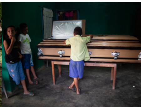
5. Children looking into an open coffin at a funeral vigil in the town of Tocoa, Bajo Aguán, Honduras.