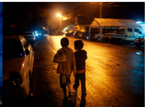
3. Two small boys walk alone at night in the streets of San Pedro Sula. In 2014, this Honduran city was declared to be the most violent in the world.