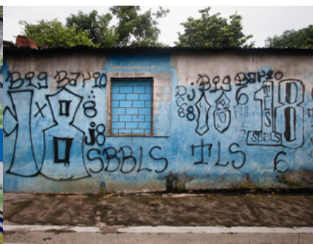
2. In the town of Lourdes near San Salvador whole neighbourhoods have been emptied of families who had to flee because of the strong presence of gangs in the area.