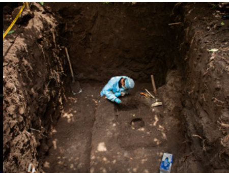
2 A prosecutor specialising in exhuming corpses in El Salvador cleans the bones of what he suspects is the body of a woman who was murdered and thrown into a well on the outskirts of El Salvador.