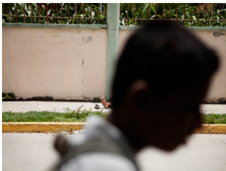
1. A student walks past the body of an eighteen-year-old youth who was shot dead outside the school of the Cabañas neighbourhood in San Pedro Sula, Honduras.

One of CINDE’s early projects was school support, giving backup classes to children in mathematics, language, and science, together with education about nonviolence. The programme grew and was able to offer scholarships for children in primary and secondary education. Some even received CINDE support for completing university degrees.