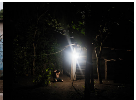
3. A member of the Mara Salvatrucha gang is arrested during a police operation. He is accused of having evicted a family from their home and moving in there himself.