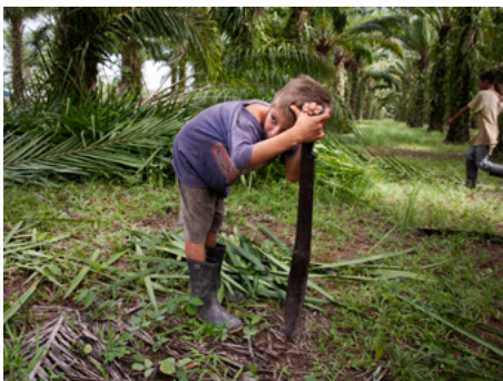
4. A boy works clearing away weeds in an African palm plantation in the Bajo Aguán zone of Honduras.