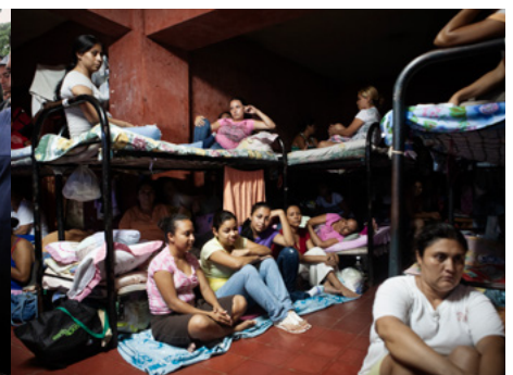
3 Inside one of the cells of Ilopango, El Salvador’s main women’s prison, one of the most overcrowded in Central America.