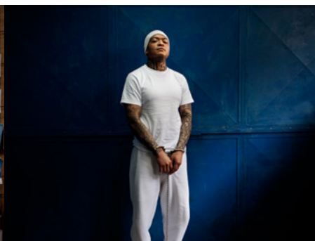
2 Jorge Yahir de León Hernández, conocido como «El Diabólico», es el líder nacional de la organización criminal Mara Salvatrucha-13 en Guatemala. Actualmente, reside en la cárcel de máxima seguridad de Fraijanes II, en Ciudad de Guatemala.