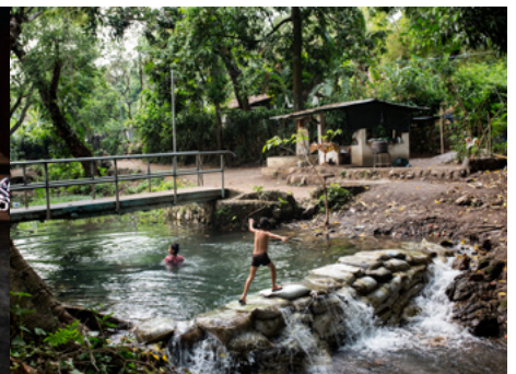
6. Two girls play in the Acelhuate River, the most contaminated in El Salvador. The river is in the municipality of Nejapa, a zone with a strong presence of the Barrio 18 gang.