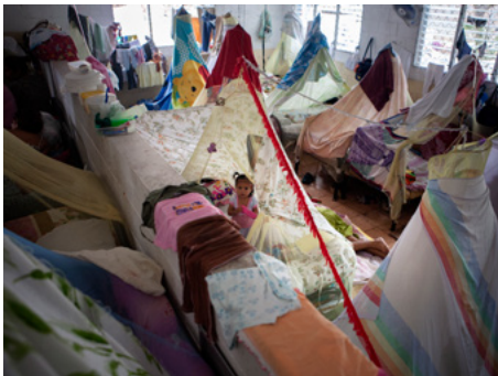
1. In the Ilopango prison for women El Salvador, there is a special section for mothers and young children, many of whom have been born within its walls and have never seen the outside world.

tral America left a traumatised population. Their impacts have been passed down from generation to generation, and even affect young people who were not born when the armed conflict ended. The proliferation of the maras (gangs) is not unrelated to this legacy of violence. Thousands of boys and girls are presently at risk of suffering the terrible consequences.