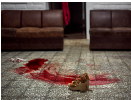
1 Scene of a murder on the outskirts of San Salvador. In May 2019, the owner of a bar was killed because she didn’t pay the extortion money demanded by the gang that controlled the area.

The Feminist Collective deals with cases of domestic violence, offering emotional support and legal advice, while also fostering a programme of family solidarity networks that provide temporary homes for women who, when fleeing situations of violence, have nowhere to go. However, the organisation’s most visible work is its struggle for decriminalisation of abortion in this country where the abortion laws are among the harshest in the world. In recent years, 17 women have been sentenced to up to 30-year imprisonment for homicide after having an abortion.