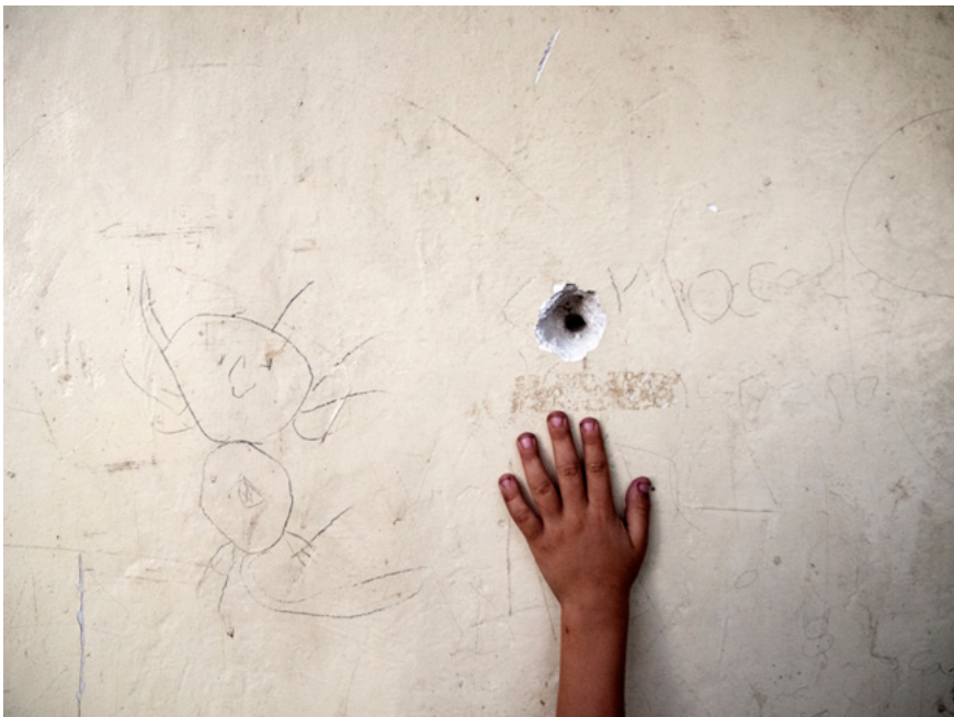
A bullet hole in a wall where children play in Bajo Aguán, Honduras, is a reminder of the violent conflict over access to land involving farmers, police, and powerful landowners. As a result, 128 people were murdered between 2008 and 2013.