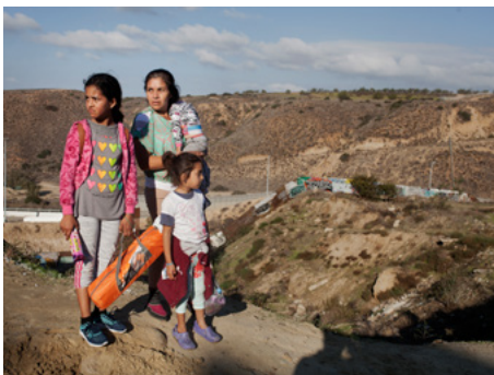
1. A woman from Central America walks with her daughters to the wall that separates Mexico from the United States in the Tijuana zone in their attempt to cross the border.

The route of approximately 4,000 kilometres from the Northern Triangle is the scene of a humanitarian crisis that is both serious and little known. In addition to the risk of being arrested, the people making the journey have to confront, on a daily basis, all kinds of abuse and the danger of being kidnapped, tortured, raped, or murdered, especially by members of organised criminal gangs. The numbers of people who have disappeared in these circumstances have risen in recent years.