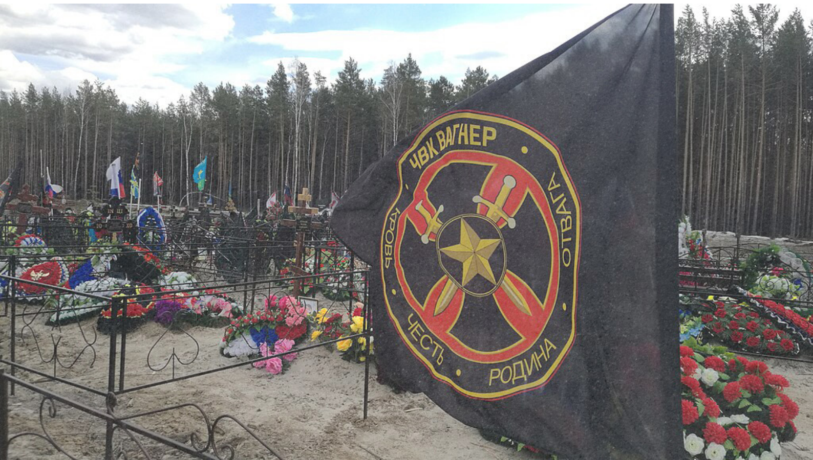
Wagner's plot at the Chervyshev cemetery. Tyumen, Russia.

olence in the training phases, where cases of inhuman treatment have been reported. 271 Behind these patterns there was a culture of violence built around a hierarchical and centralised structure with very strict and violent norms of conduct, similar to the codes of criminal gangs. Indeed, Wagner's founder was in prison for 13 years and his extensive knowledge of, and ties with, the criminal world are reflected in the origin of Wagner and the design and promotion of its brand.