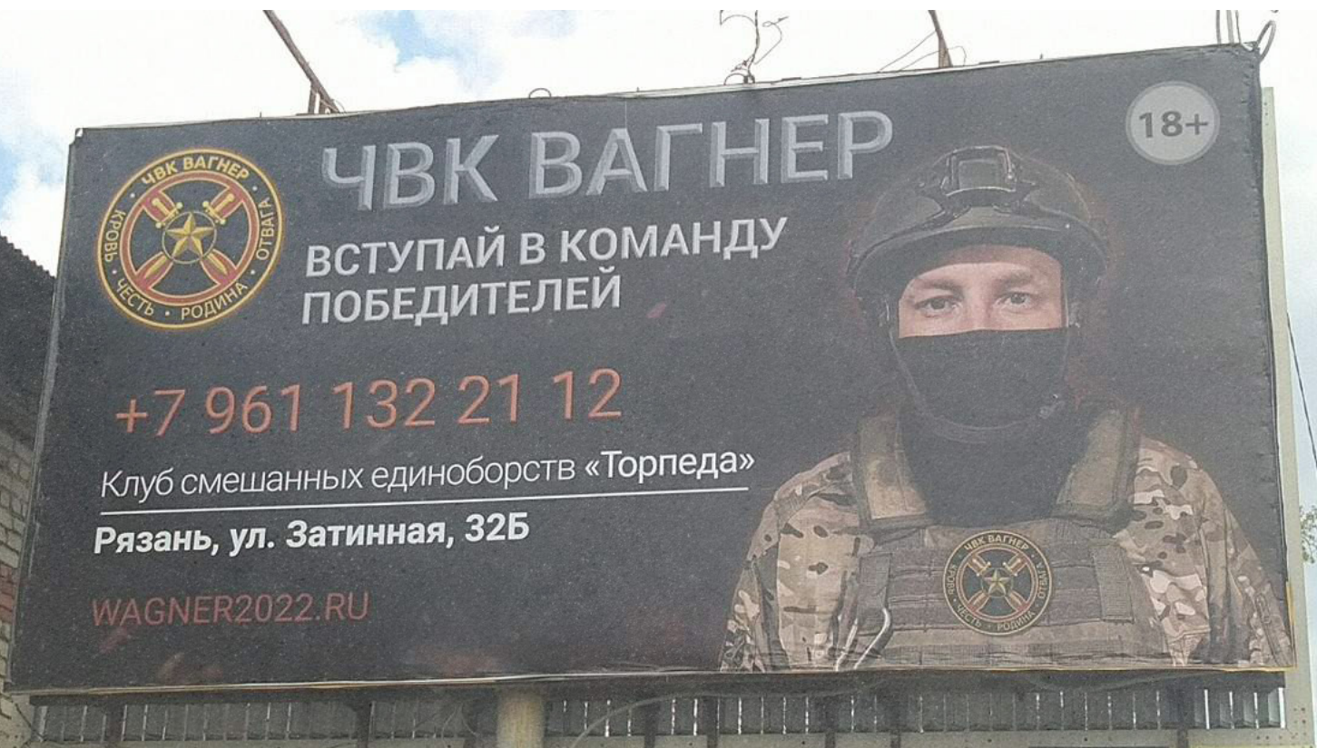
Recruitment banner in Russia.

the invasion of Ukraine, their participation in the conflict resulted in catastrophic losses, allegedly losing up to 90% of its forces. 110