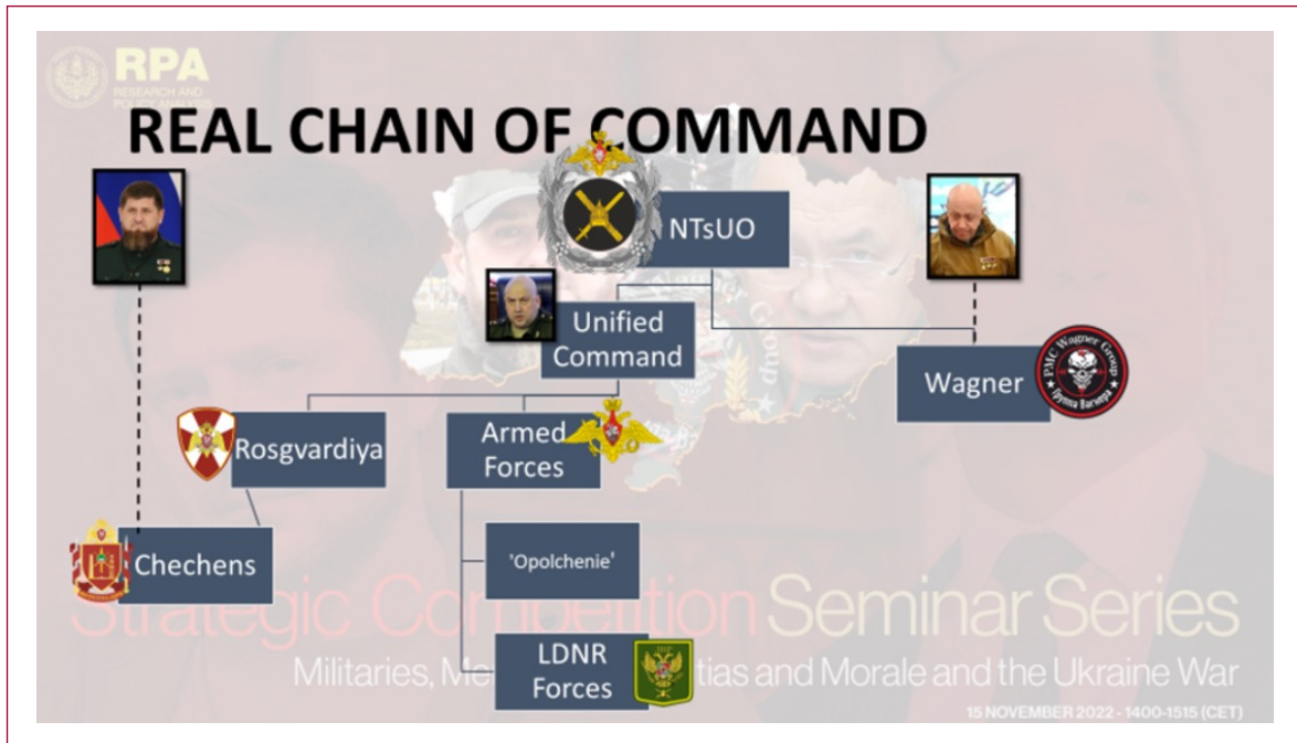
Image: Russian Military Chain of command in Ukraine in 2022.

Besides that, the Wagner Group copied the military structures of the North Atlantic Treaty Organization (NATO), combating in small groups and divided in different rows. 33 Concretely, under the Command Unit, the following subunits are identified: