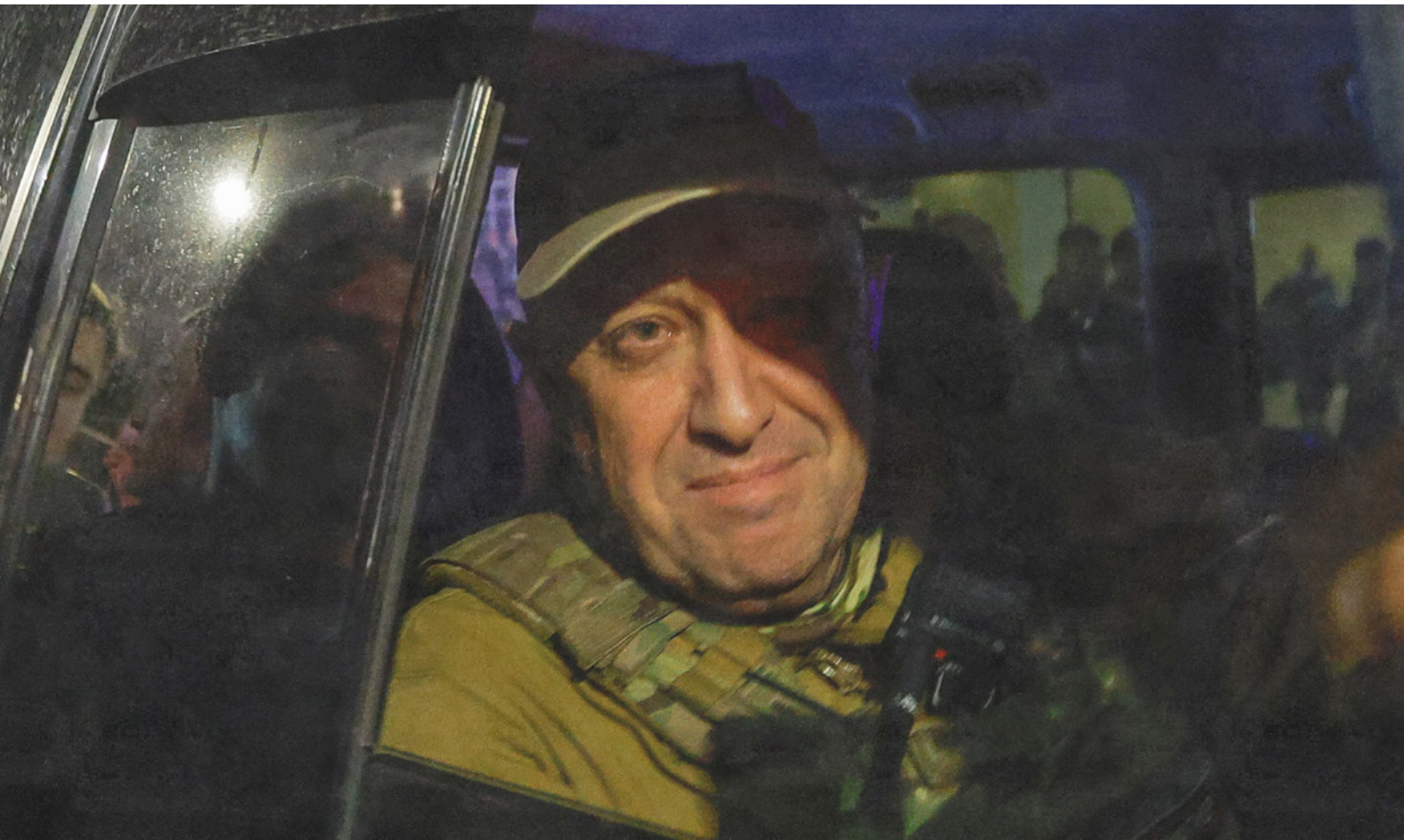
Prigozhin during the withdrawal of troops from Rostov-on-Don on June 24th 2023.